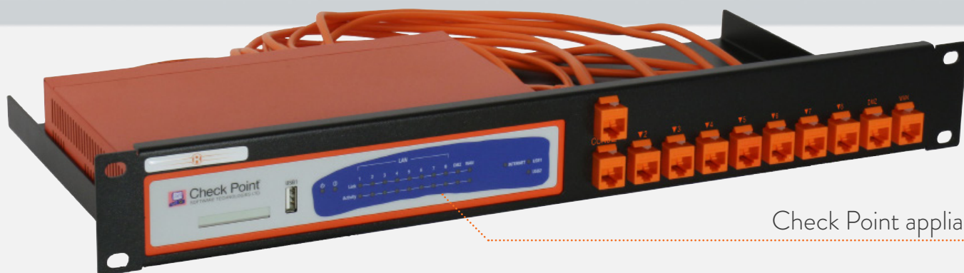
Check Point appliance